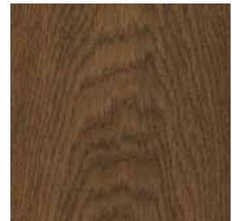
3075 Black on Oak

>>> PRODUCT RECOMMENDATIONS FOR THE OPTIMAL MAINTENANCE OF FLOORING. PAGES 22 – 23