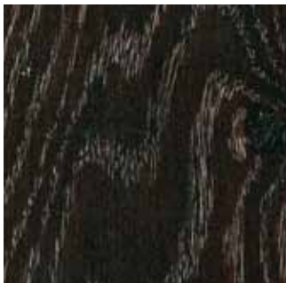
3091 Silver on smoked Oak