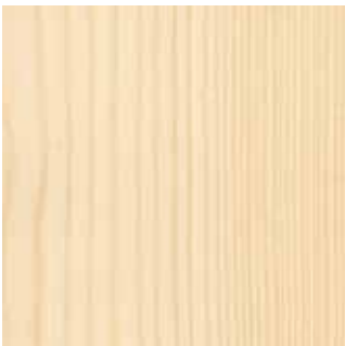
3040 White on Spruce

EVEN COLOUR TONE FOR A HARMONIOUS FINISH