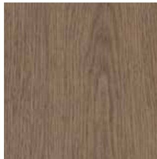
3074 Graphite on Oak