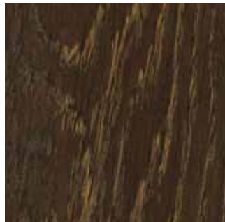
3092 Gold on smoked Oak